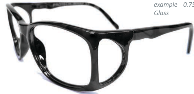
Fig A - Side shield example - 0.75mm Pb Glass

Many of our frames come with side shields for maximum protection. There are two types of side shields - glass and vinyl strips. For both the vinyl strips and glass side shields, the standard protection is 0.50mm Pb. Some frames are able to accommodate a 0.75mm Pb glass, such as the 53 Wrap shown here (Fig A.).