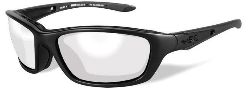
Facial Cavity Seal