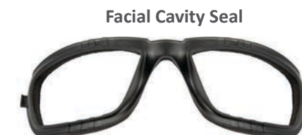
Facial Cavity Seal