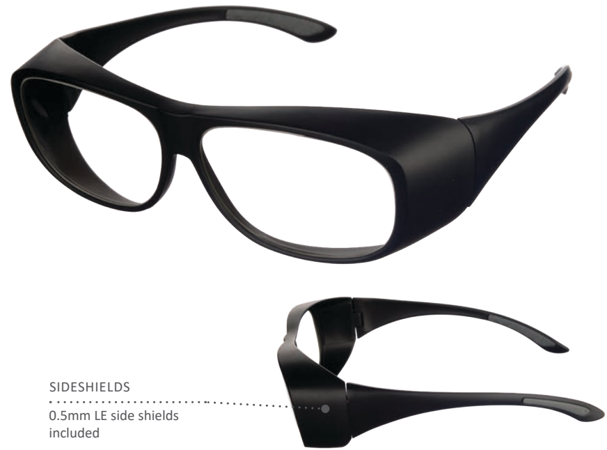
SIDESHIELDS 0.5mm LE side shields included