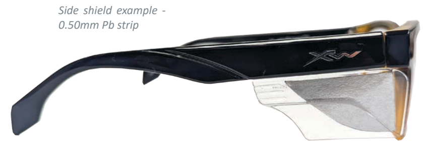
Side shield example - 0.50mm Pb strip