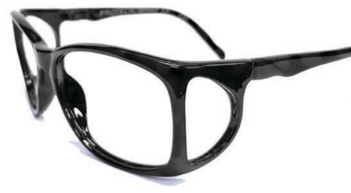
Fig A - Side shield example - 0.75mm Pb Glass

Many of our frames come with side shields for maximum protection. There are three types of side shields - glass, side shield attachments (SSA) and vinyl strips to existing side shields (SS). For all side shields types, the standard protection is 0.50mm Pb. Some frames are able to accommodate a 0.75mm Pb glass, such as the 53 Wrap shown here (Fig A.).