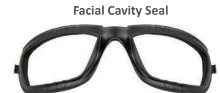
Facial Cavity Seal