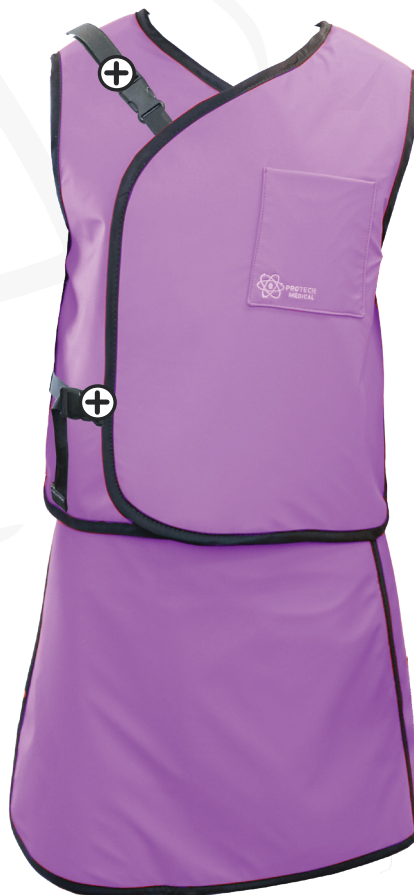
Example of a 0.35mm LE Essential Vest Skirt Apron Lead Configuration

Be prepared for prolonged procedures with the Vest Skirt apron. The two piece design shifts 70% of the weight directly to the hips, reducing back fatigue. The Essential apron configuration features extended front panels to achieve a 3/4 overlap (where protection is doubled) which allows for a lighter weight apron without compromising protection. The skirt comes standard with a premium non-slip fabric in the back. Essential aprons are only available in standard sizes. For a made-to-measure Vest Skirt, see the Balance Vest Skirt Apron.