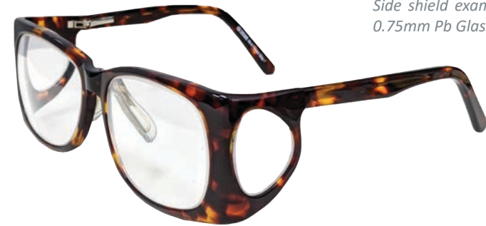
Side shield example - 0.75mm Pb Glass

Many of our frames come with side shields for maximum protection. There are two types of side shields. Depending on the frame, some will accommodate a 0.75mm Pb glass side shield while others allow for a 0.50mm Pb strip.