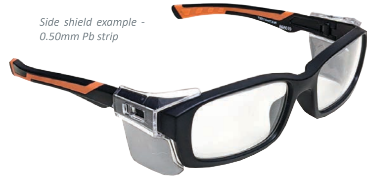
Side shield example - 0.50mm Pb strip